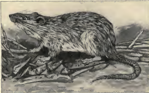
FIG. XXXIV. HODOMYS ALLENI. ALLEN'S WOOD RAT.